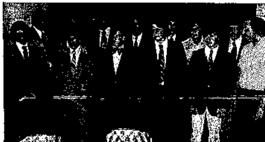
Xi Sigma Pi initiates Dec. 4, 1973